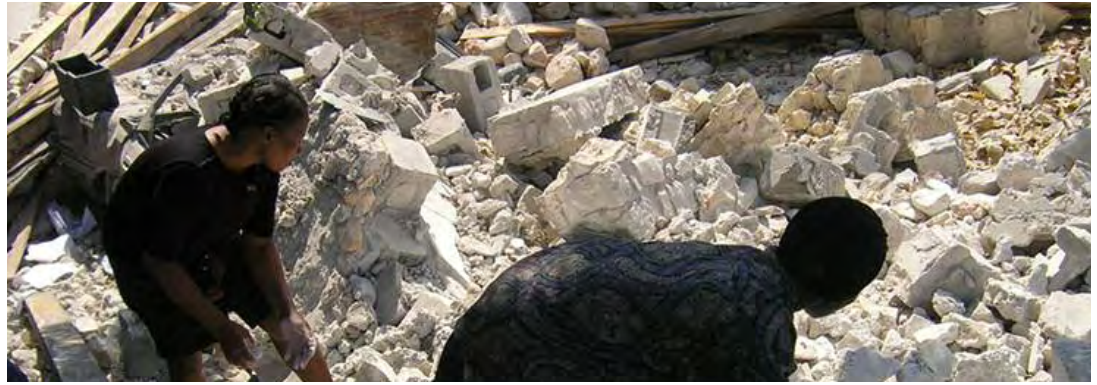
The Appeal to Rebuild Holy Trinity Cathedral Port-au-Prince, Haiti